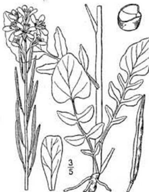
USDA-NRCS PLANTS Database / Britton, N.L., and A. Brown. 1913. An illustrated flora of the northern United States, Canada and the British Possessions . Vol. 2: 177.

Whatever it is called, its faithful, countless, bright yellow flowers are a featured part of every Spring's promised kaleidoscope.